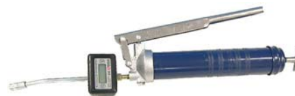
Pneumatic grease gun

Call your Authorized distributor for details and pricing: