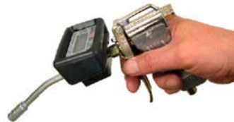
Manual grease gun