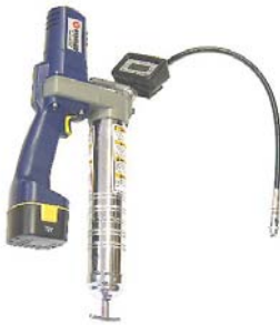
Cordless grease gun

One of the marks of a good product is that it is interoperable with existing equipment and it fits simply within your companies needs, good design and a wide array of options help the Greasemeter achieve these.